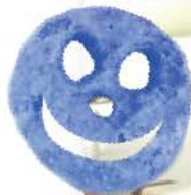
Kill Bill Volume 1