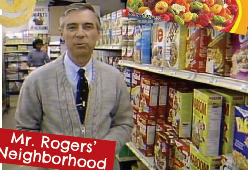
Mr. Rogers' Neighborhood