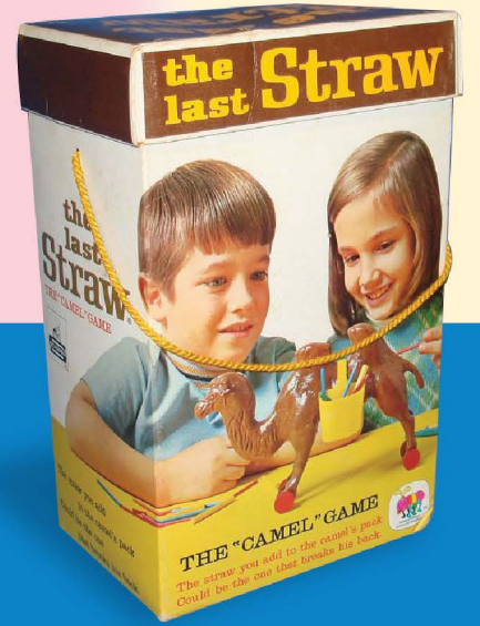
circa 1972 packaging