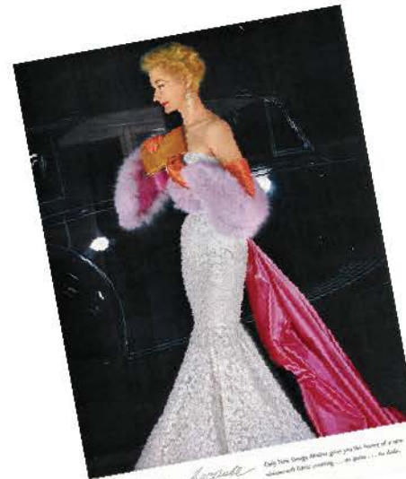
Modess...because Only True Orange Modess gives you the beauty of a new napkin with fabric covering... in the shade... in the sun...