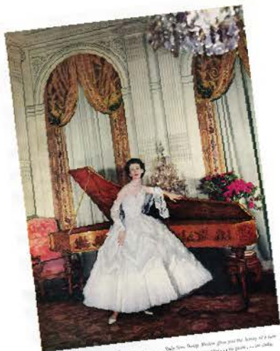
Modess...because Only True Orange Modess gives you the beauty of a new napkin with fabric covering... in the shade... in the sun...

From 1948 through the 70's the infamous "Modess®...because" fashion campaign featured elegantly dressed woman in timeless settings. Many of these spreads were shot by famous fashion photographers of the day.